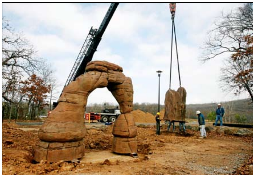
Crews use heavy equipment to install new fabricated rock climbing boulders near the entrance of Turkey Mountain on Monday.