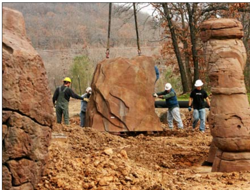
The rock-climbing boulders at Turkey Mountain will offer three levels of challenge to climbers.