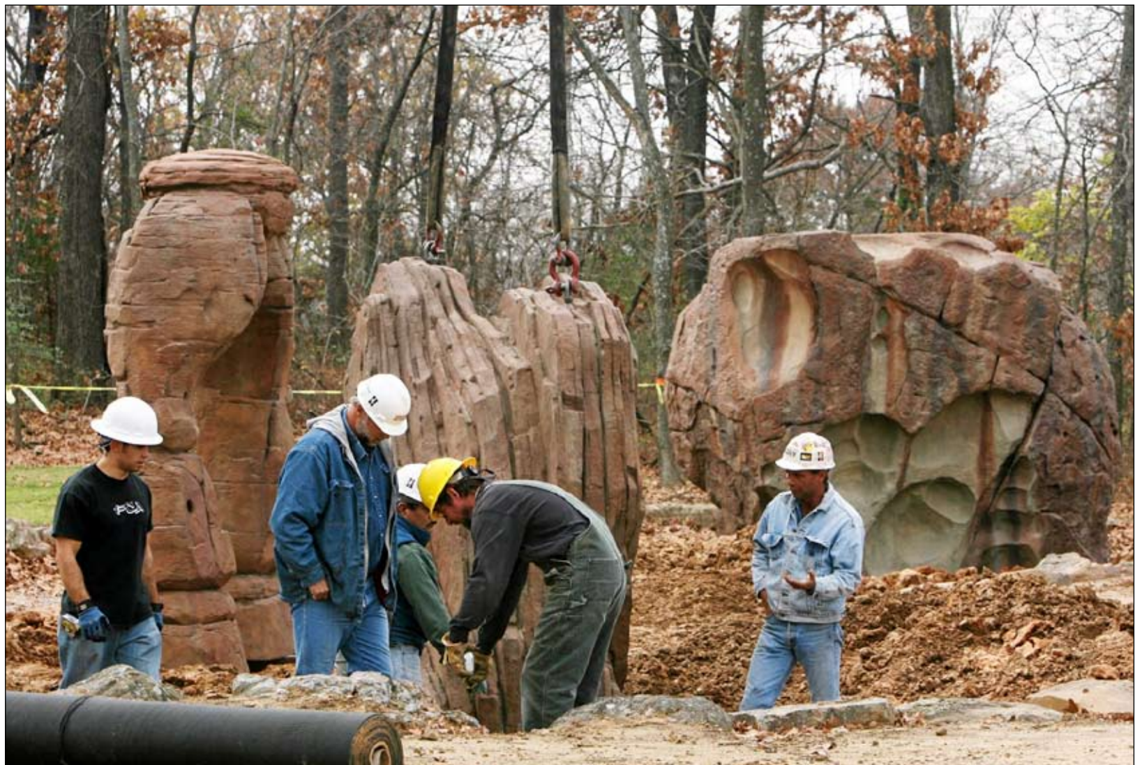
Workers install three new rock climbing boulders near the entrance of Turkey Mountain on Monday.