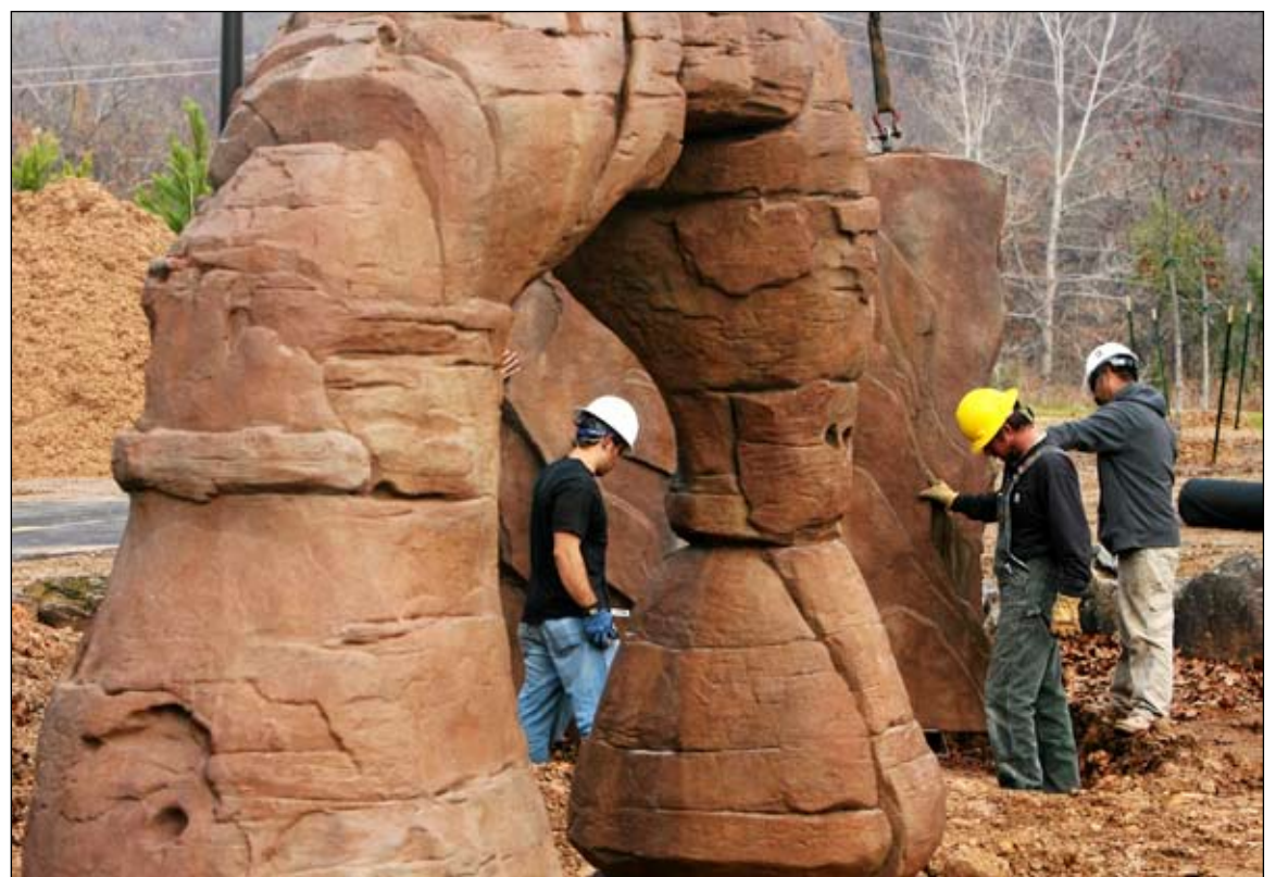
The fabricated boulders have natural-looking rock indentations as opposed to a climbing wall's finger grips.

Sandstone Flake: beginner, 7 feet tall Large Delicate Arch: intermediate, 11 feet wide, 9 feet tall Hueco Tanks: advanced, 11 feet wide, 9 feet, 6 inches tall